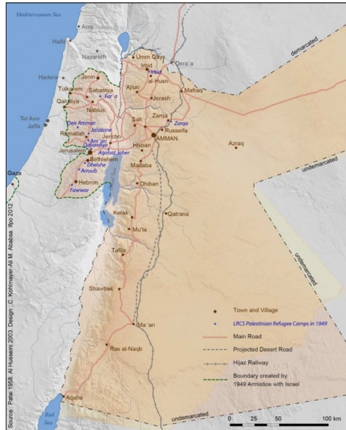
Figure 2: Map of the East and West Banks 29

In addition, the Transjordanian government quickly took steps to include Palestinians in the national community. In February 1949 (a month before the war's end), the government issued a supplemental law, or “addendum (لائحة)”, to the passports law that granted Palestinians access to Transjordanian passports. Article 2 of this supplemental law stated: “No matter what is stated in the second article of the Passports Law No. 5 of 1942, any Arab Palestinian person holding a Palestinian nationality may procure a Transjordanian passport in accordance with the Passports Law No. 5 of 1942”. 30 In addition, Article 3 specified that “The provisions of the aforementioned passport law and the bylaws, regulations, and orders issued according to it shall be applied to persons who obtain passports in accordance with this addendum”. 31